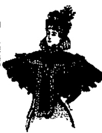
BUTTERICK PATTERN 201A.

Everything in dress goods, children's clothing, ladies' underwear, etc. Desires to call the attention of the purchasing public to his stock.