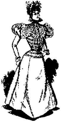
BUTTERICK PATTERN 200A.

Now coming in shows a beautiful selection in Hats, Flowers and Ribbons